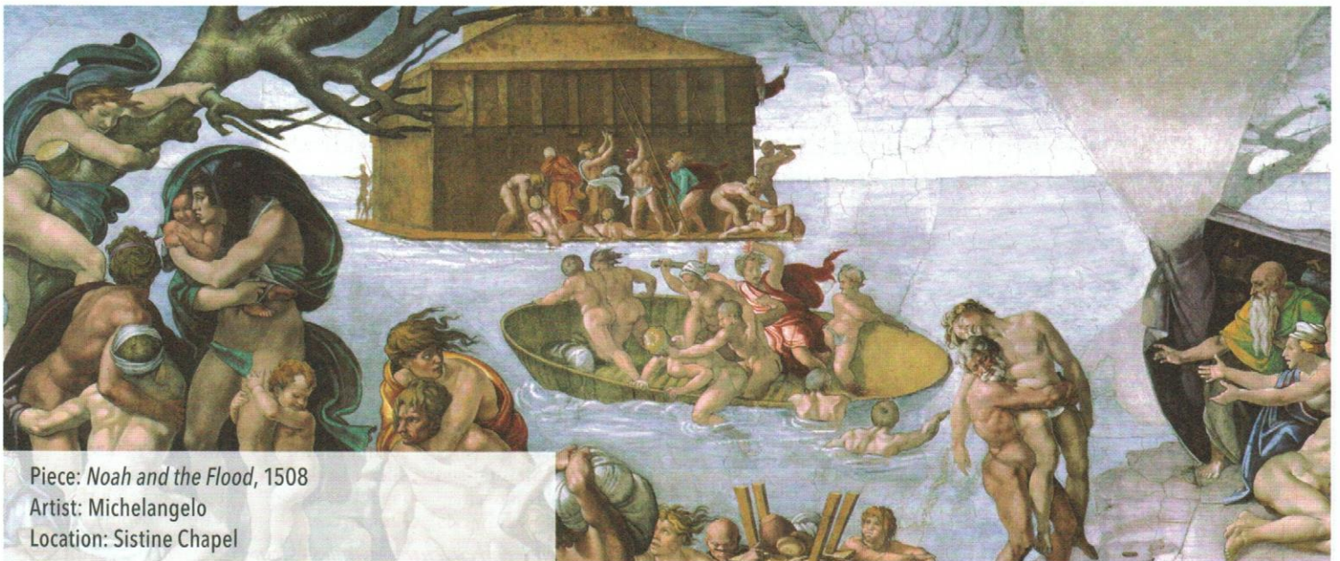
Piece: Noah and the Flood , 1508

What important lessons have I learned from a challenge in my life? Maybe I can share that lesson with a friend or family member.