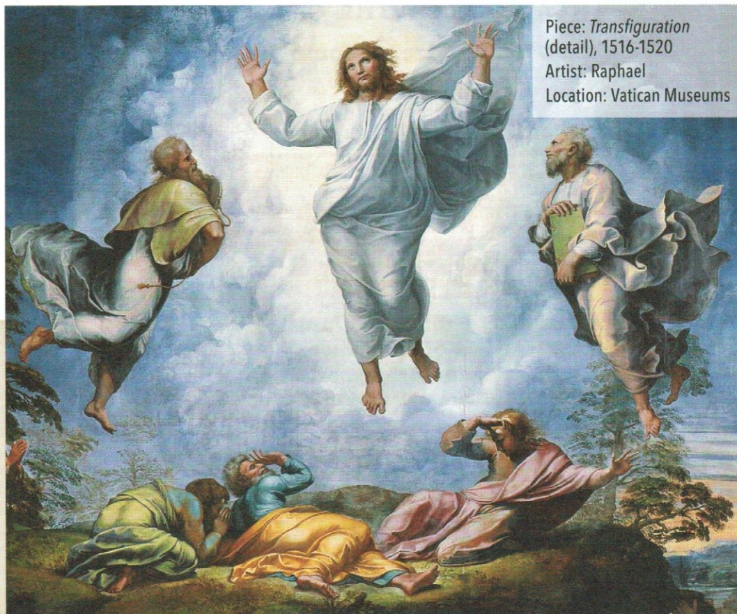
Piece: Transfiguration (detail), 1516-1520 Artist: Raphael Location: Vatican Museums

All light comes from energy consumed and transformed. How does that truth apply to your spiritual life?