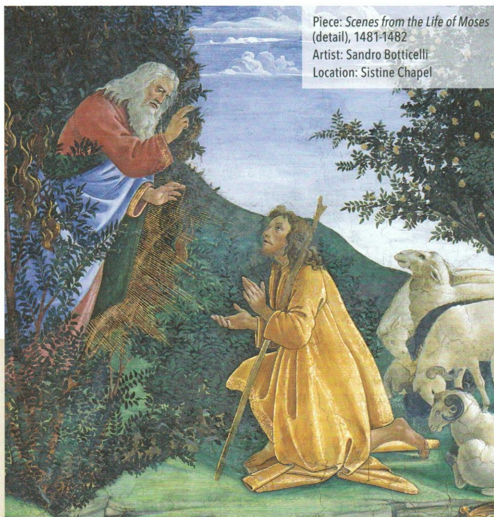
Piece: Scenes from the Life of Moses (detail), 1481-1482