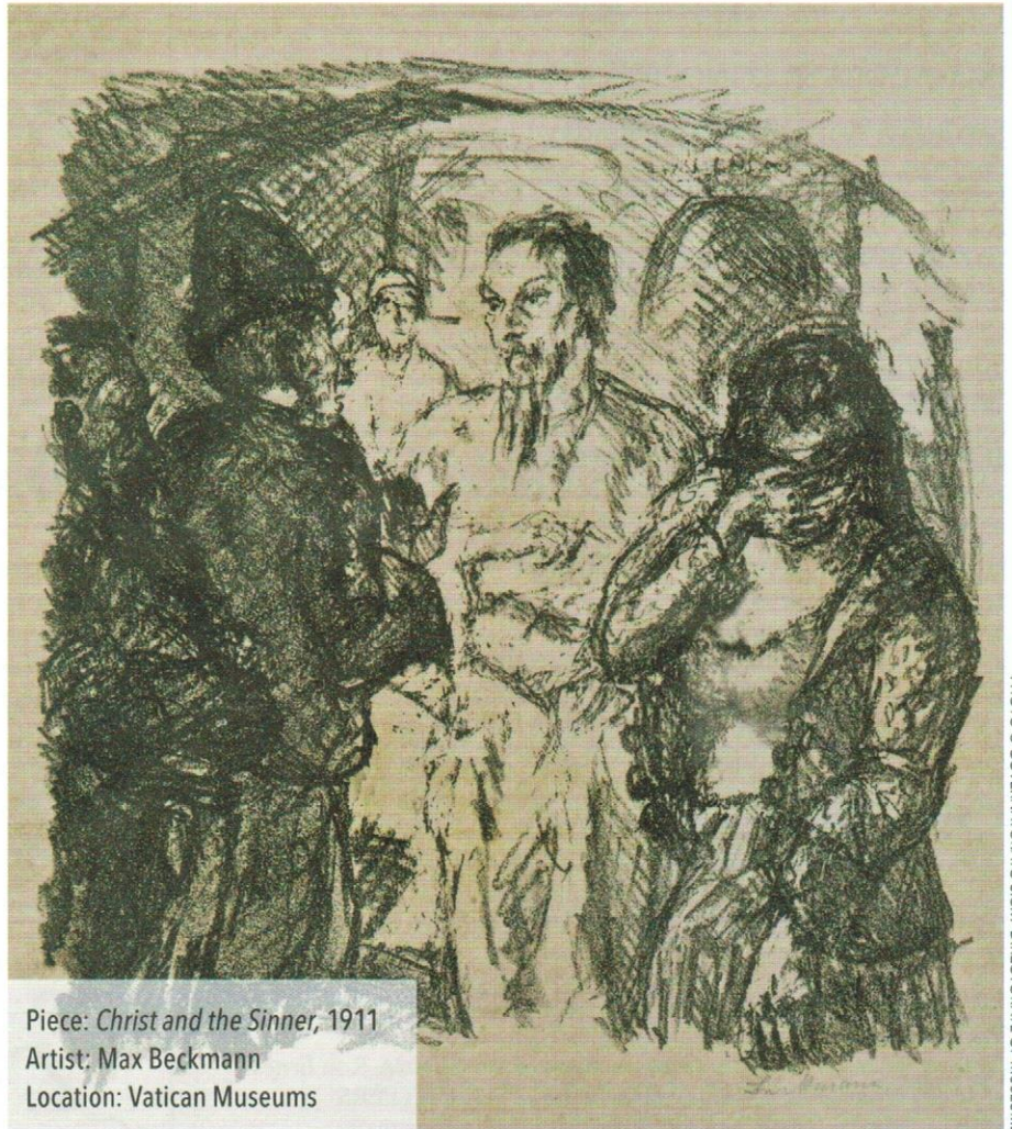
Piece: Christ and the Sinner , 1911 Artist: Max Beckmann Location: Vatican Museums