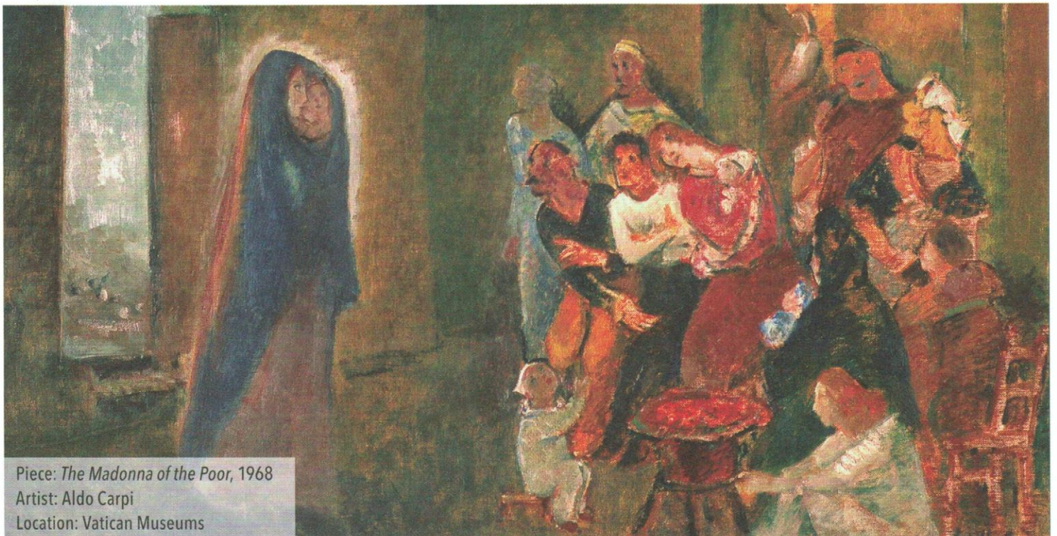
Piece: The Madonna of the Poor , 1968

How often do I help or love someone who disagrees with me, or doesn't believe what I believe?