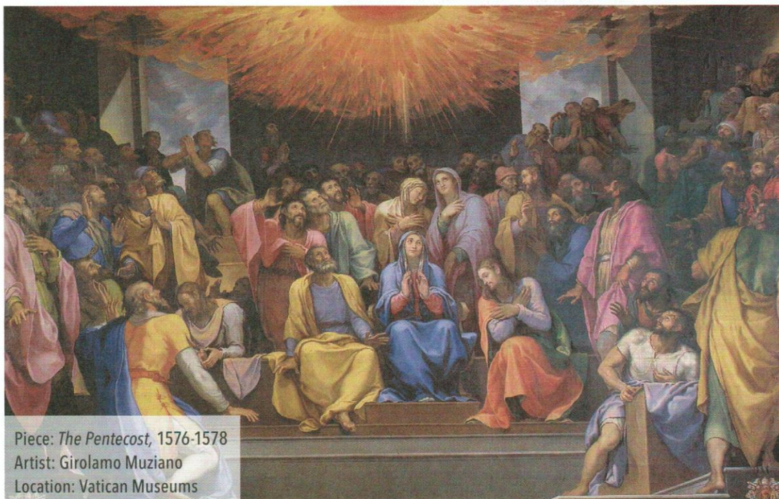
Piece: The Pentecost , 1576-1578

Jesus declared to the apostles at the Last Supper that the Holy Spirit would remind them of all he told them. Jesus gave this gift to the Church, and it's something we should value. How often do we do an internet search about a subject and then trust what a few articles say? Yet, are we as quick to look up what the Holy Father and the bishops say on different subjects in order to be guided by that light?