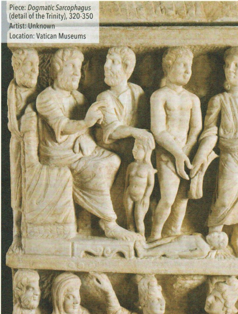
Location: Vatican Museums