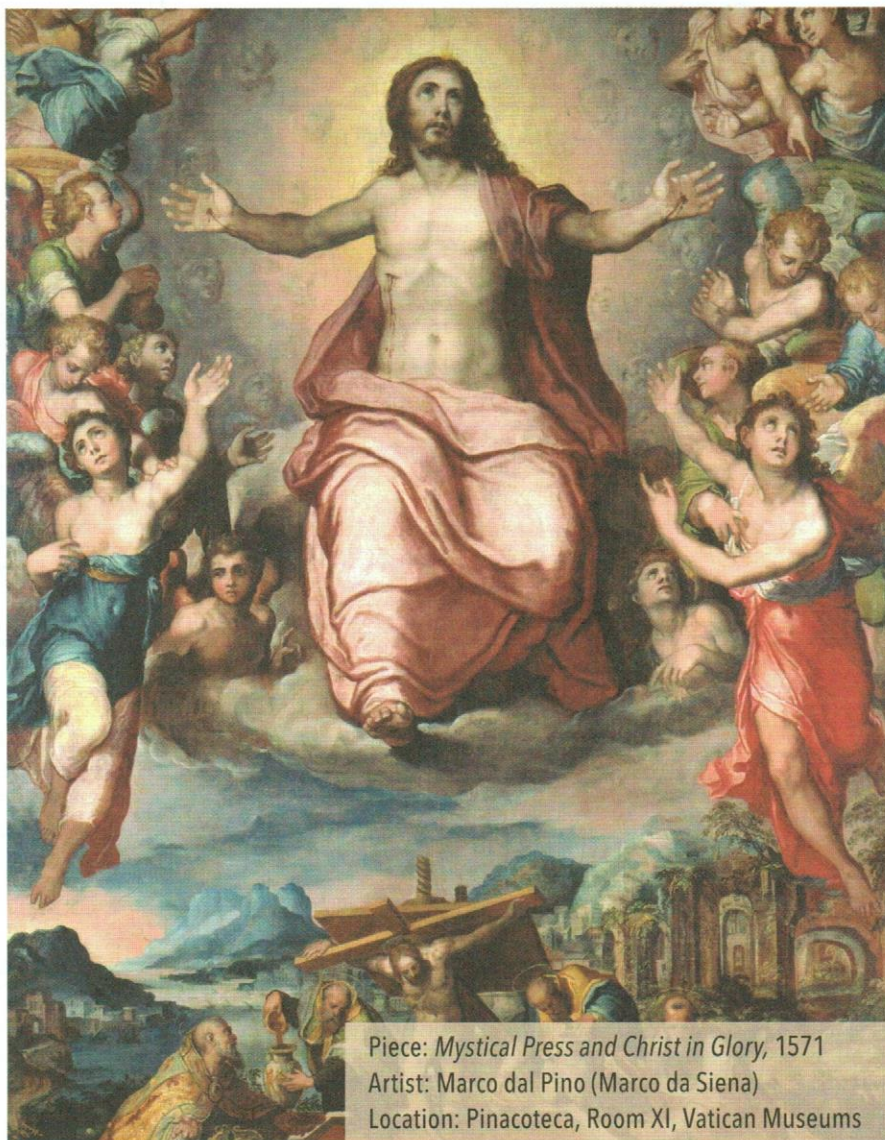
Piece: Mystical Press and Christ in Glory , 1571

How can I yoke myself to Jesus, my Lord and king? What burdens, stressors, or disappointments can I hand over to God this week?