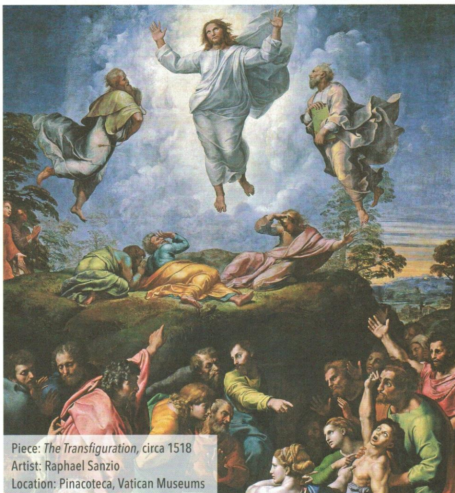
Piece: The Transfiguration , circa 1518 Artist: Raphael Sanzio Location: Pinacoteca, Vatican Museums

Here is where we need the power of God's mercy and love. Peter wanted to stay in Christ's presence and enjoy it, soak it up, remain, and never go down the mountain again. He heard the Father's voice, knew he should listen to the Son, and was resolved to do so! Although