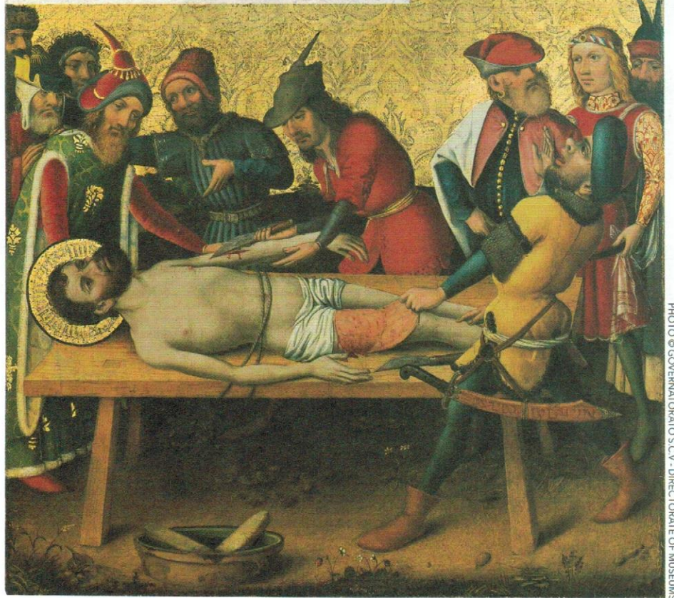
Piece: Martyrdom of St. Bartholomew , fifteenth century Artist: Rhenish School Location: Vatican Museums