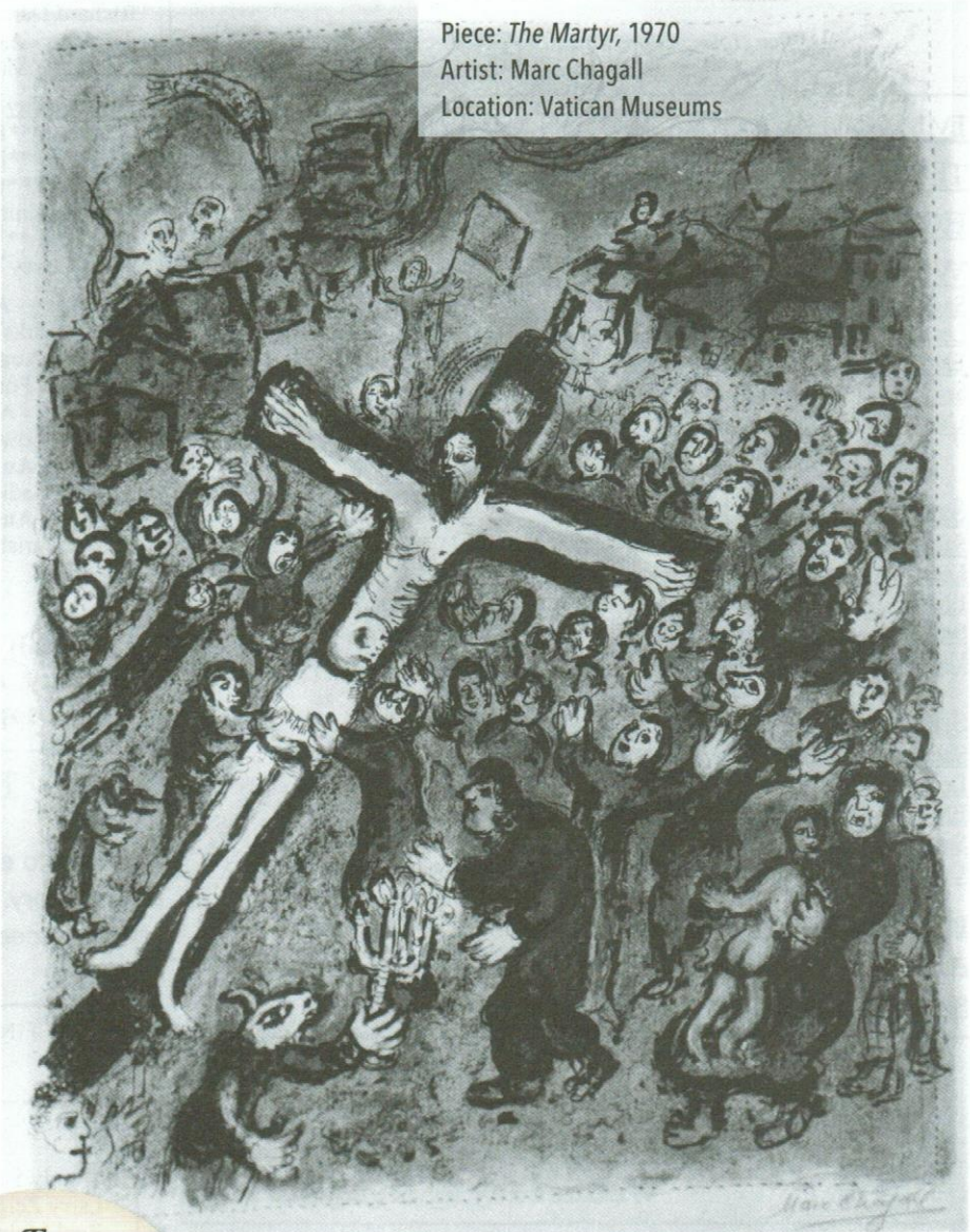
Piece: The Martyr , 1970 Artist: Marc Chagall Location: Vatican Museums

[Jesus said,] "I am the living bread that came down from heaven; whoever eats this bread will live forever."