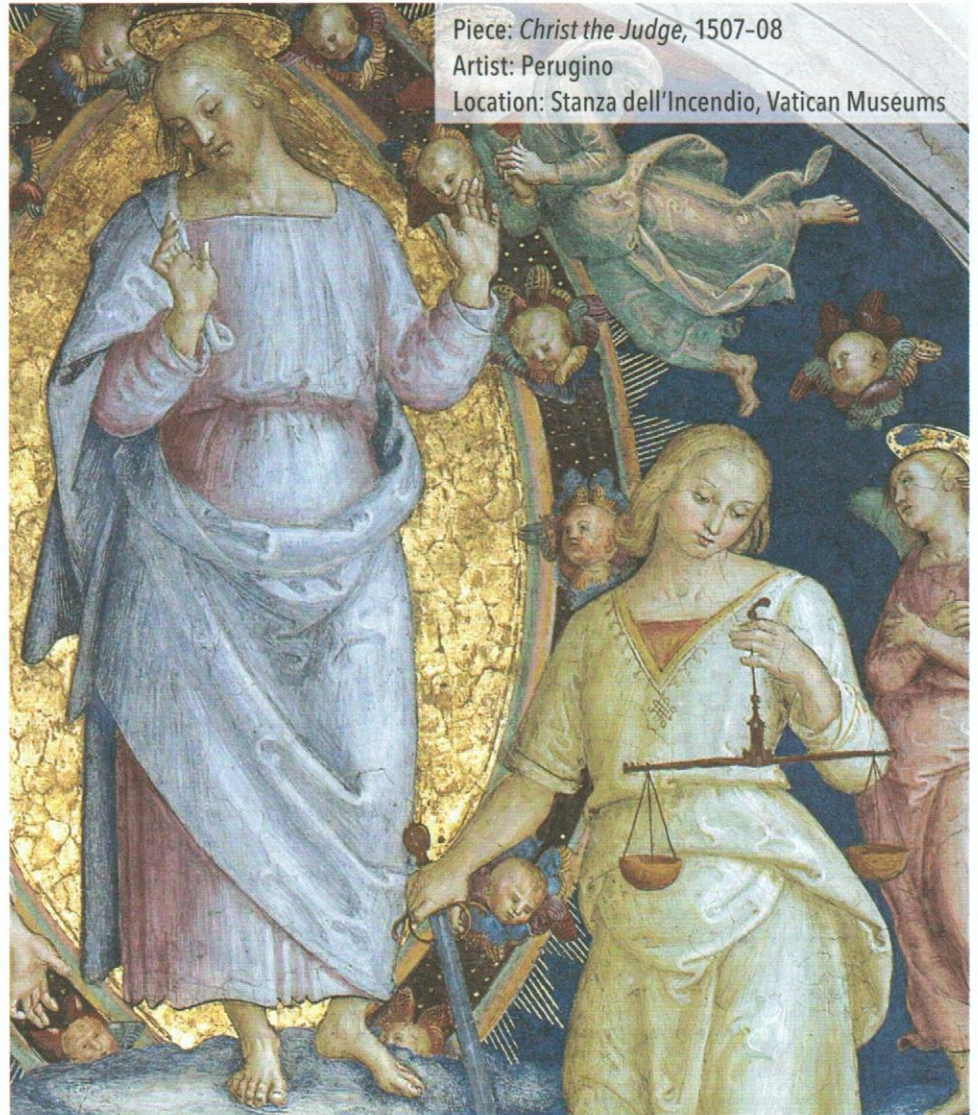
Piece: Christ the Judge , 1507-08

Remember, as Jesus said: “The measure with which you measure will be measured out to you” (Matthew