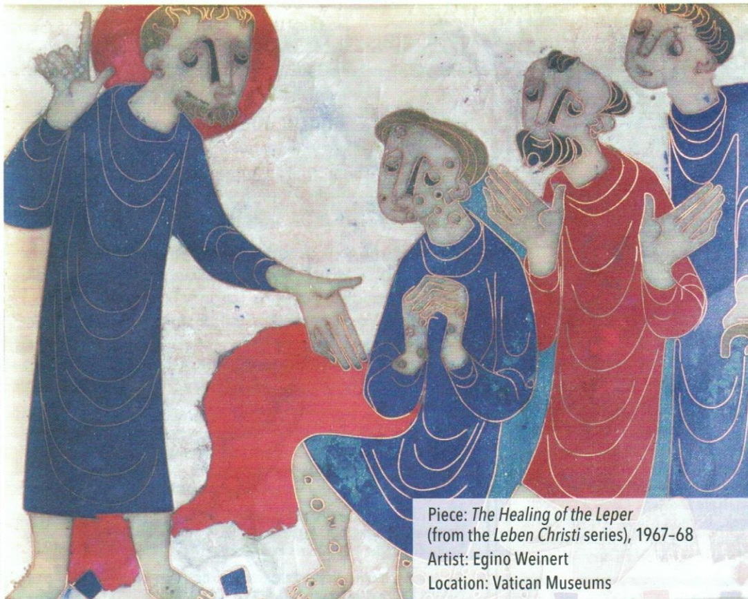
Piece: The Healing of the Leper (from the Leben Christi series), 1967-68 Artist: Egino Weinert Location: Vatican Museums