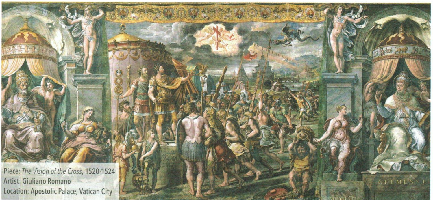
Piece: The Vision of the Cross , 1520-1524

Do I give more credence to fads or feel-good philosophies than to the truth revealed by Jesus?